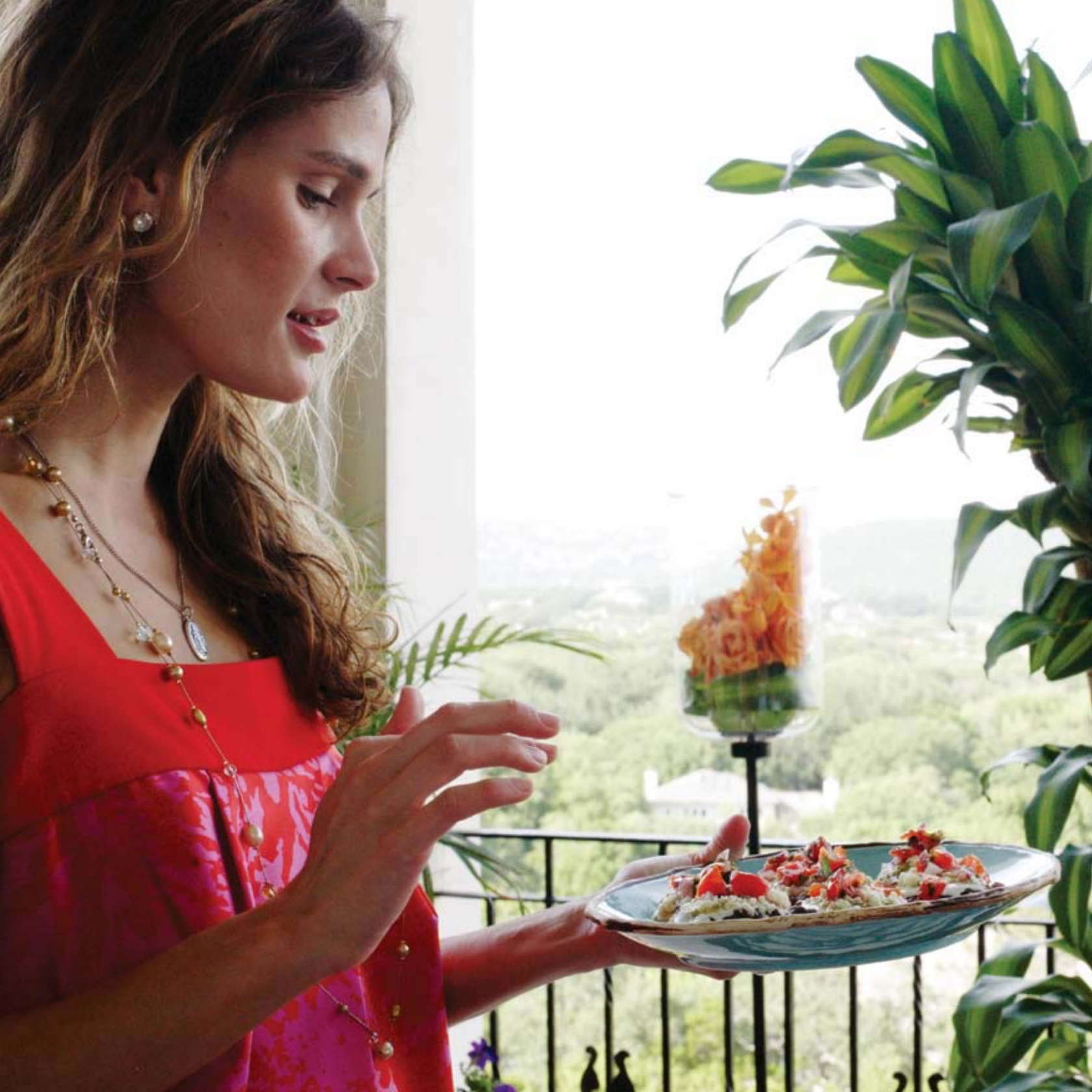
FACING PAGE Author and cooking show host Marie Saba serves her happy guests black bean tortas with pico de gallo on a serving dish from Breed & Co.