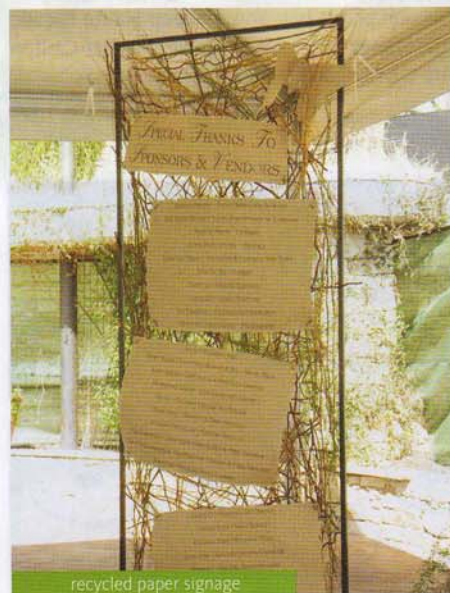
recycled paper signage